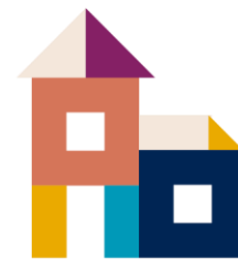
Explained with a story